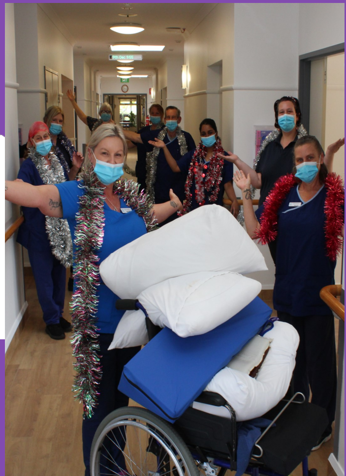
Staff at Kirrak House